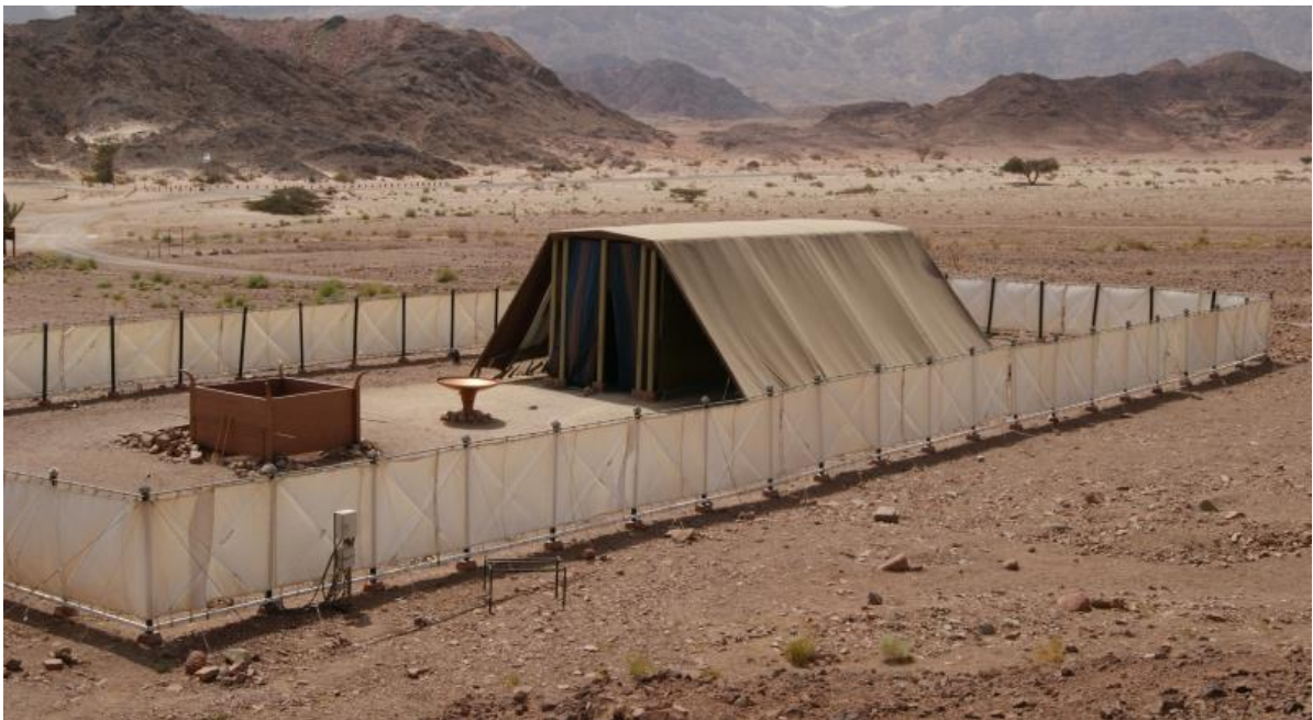
Model of the tabernacle in Timna Valley Park, Israel